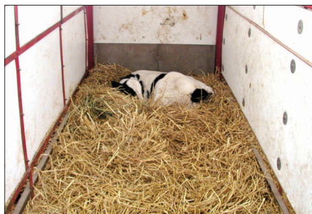
Nesting Score 3 Legs generally not visible when laying 8