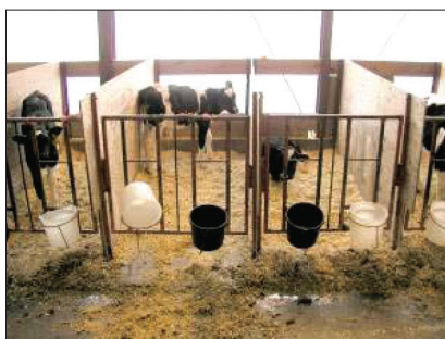
Nesting Score 1 Legs entirely visible 6