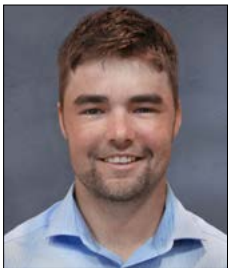
By Erik Brettingen, B.S.

The stress caused by weaning decreases a calf's immune function and makes them more vulnerable to disease. For many years it has been common practice to give medicated feeds, pellets, or additives around the time of weaning to decrease the incidence