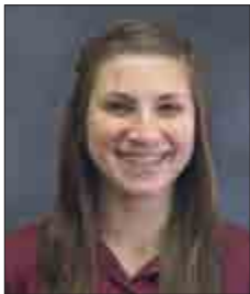
By Jessica Getschel, B.S.

Understanding the basic principles of calf barn ventilation is essential in evaluating the many different ventilation options available today. There is no single ventilation system that will work for every situation because each calf barn is unique in its structure and layout.