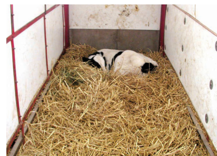
Nesting Score 3 Legs generally not visible when laying.

Source: University of Wisconsin Madison - School of Veterinary Medicine