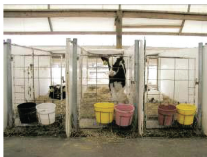
Nesting Score 2 Legs partially visible when laying.