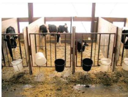
Nesting Score 1 Legs entirely visible.